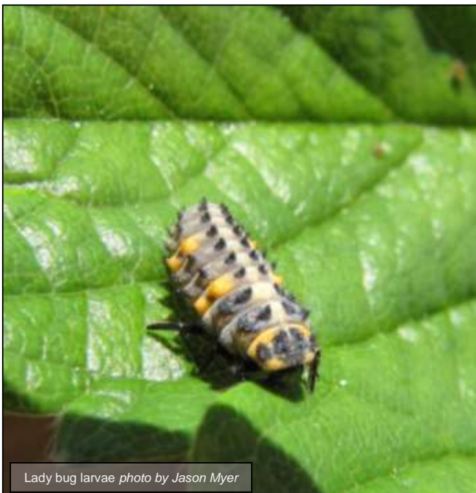
Lady bug larvae

The Weather Cafe by Rufus La Lone Small Fruit Cold Storage report