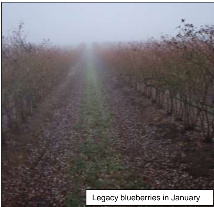
Legacy blueberries in January

The Weather Cafe by Rufus La Lone Small Fruit Cold Storage report