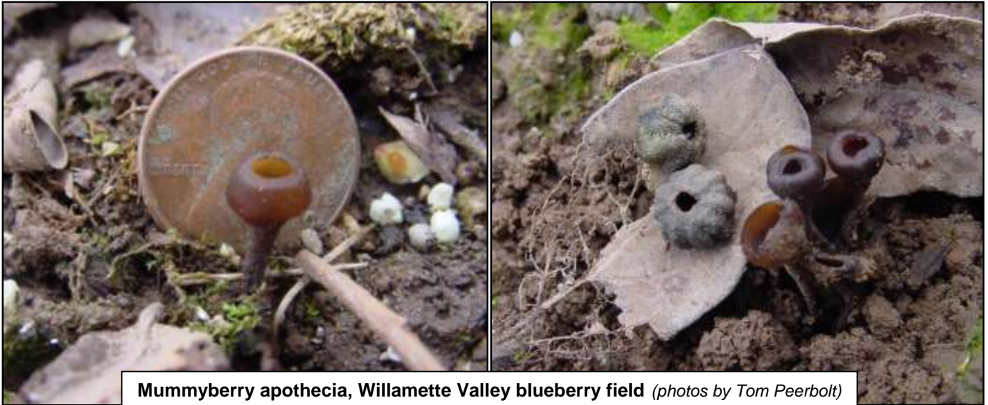
Mummyberry apothecia, Willamette Valley blueberry field