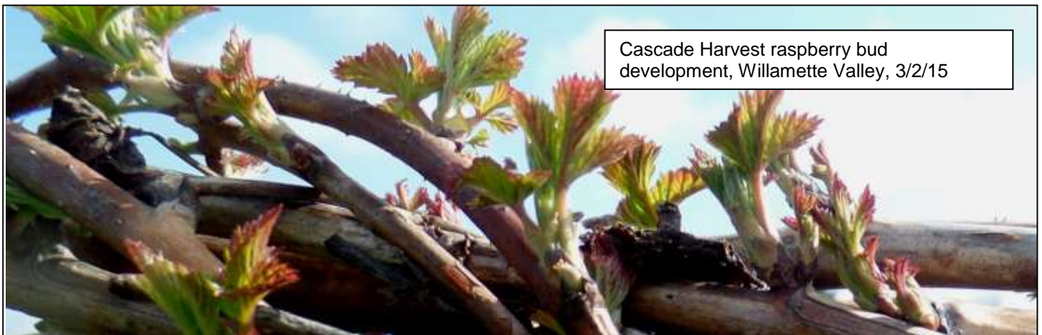
Cascade Harvest raspberry bud development, Willamette Valley, 3/2/15