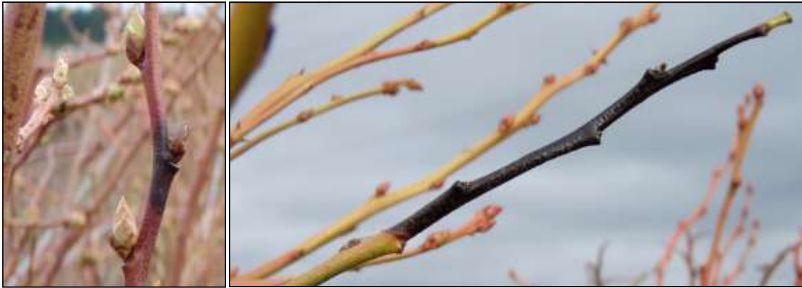
Pseudomonas syringae (bacterial canker) symptoms in blueberries