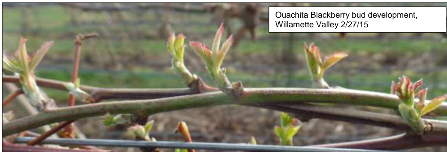
Ouachita Blackberry bud development, Willamette Valley 2/27/15

Click here to go back to the top of this newsletter.